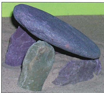
Portal Tomb in tray