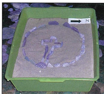
Passage Tomb in tray